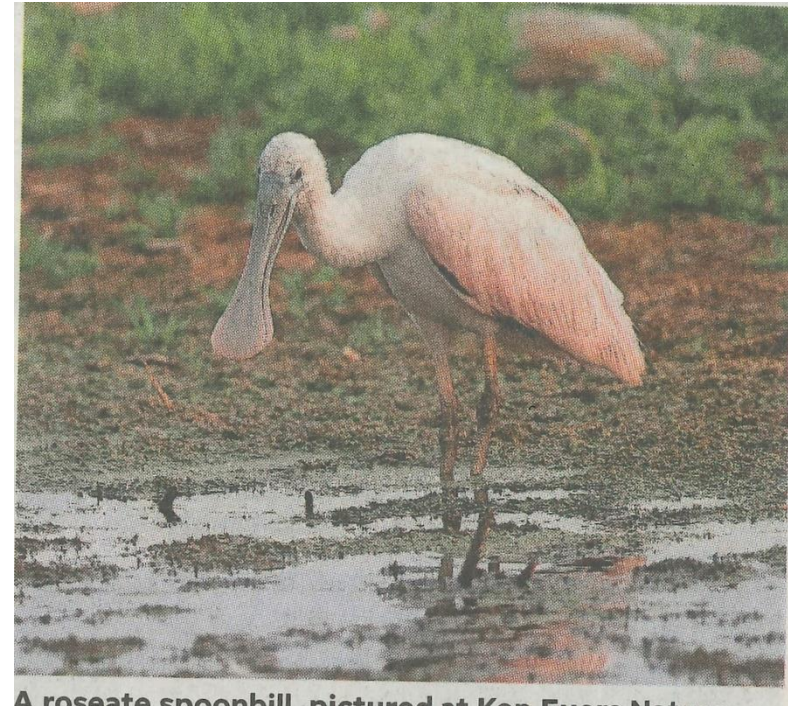
A roseate spoonbill, pictured at Ken Euers Nature Area in Green Bay, hasn't been seen in Wisconsin in 178 years.

October 28 Hunter's moon November 27 Beaver's moon Bird's In Art LYW Wausau Increased road traffic by deer Winter bird residents arriving Dig out winter clothing