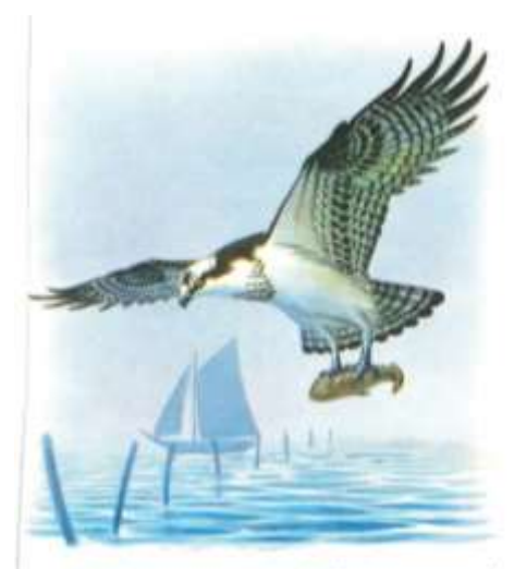
OSPREY The Ouprey or Fish Hawk (22 in.) occurs around the world. It is smaller and slimmer than the eagles, and has a large black spot under the "elbow" of the wing. No other large hawk has as much white below. It flies with a characteristic backward bend at the "elbow." It shape nest may be placed on an isolated free, a tower, a channel marker, or a duck blind. The birds wheel and soar over lakes, bays, and oceans, plunging feet foremost after fish. Young are similar to adults.