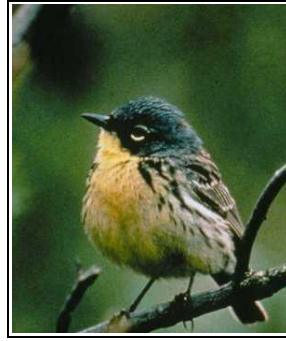
Kirtland's Warbler US Fish & Wildlife Service

We then headed back to the appointed site for the goatsuckers where we ran across three more birders parked at the spot for the same purpose. Dusk was falling, and the deer flies were replaced by what can only be described as hordes, armies perhaps, of mosquitoes. There was so much buzzing and swatting we feared we would not hear the birds we came to hear. The Common Nighthawks were already in the area hunting their share of bugs, and, as it