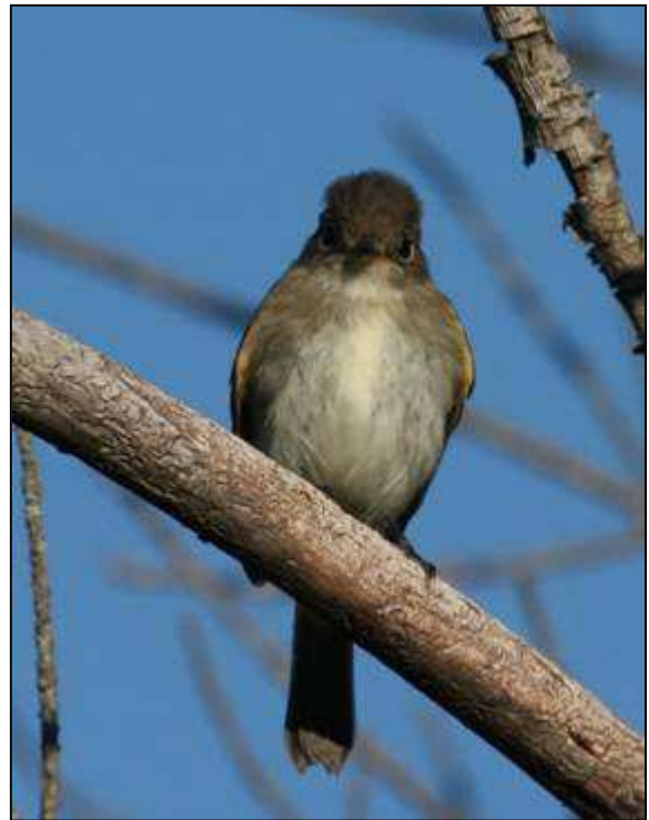
A flycatcher enjoys a perch in a dead pine tree.

I watched and took photos for about a half hour, and when the birds eventually went elsewhere, I, too, wandered off. The dead pine had given me a special