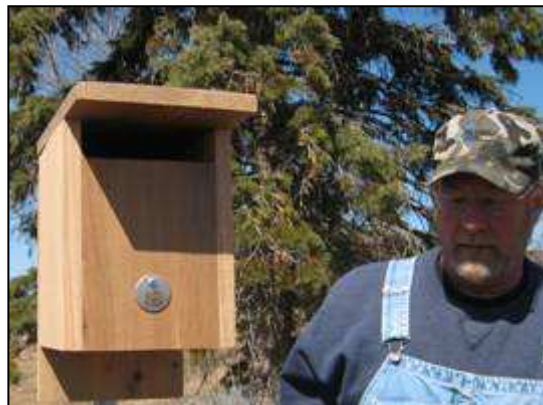
CBC members installed houses at several locations.